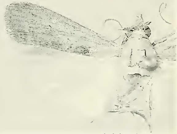
FIG. 1. Caristanius veracruzensis , male (holotype).

Description. - Forewing length 9.0 - 10.0 mm. Head: vertex pale brown to brown dusted with white; labial palpus pale brown to brown dusted with white and extending obliquely to above vertex in both sexes, robustly scaled and in contact with vertex in male; maxillary palpus ochre, mostly long-scaled in male, pale brown to brown dusted with white, short-scaled in female; antenna of male with sinus and well developed, brown, dusted with white, tuft of scales at base of shaft and with sensilla trichodea (cilia) of shaft abundant and about 1/7 as long as width of shaft just distad of sinus; antenna of female simple. Thorax: dorsum pale brown to brown lightly dusted with white (some specimens with ochre or pale reddish brown scales). Forewing: mostly brown dusted with white; antemedial line very weakly formed, only visible on some specimens on posterior half of wing; brownish red patch shaded by varying amounts of black basad of antemedial line; postmedial line absent or very faint; discal spots dark brown. Hindwing: above chiefly white,